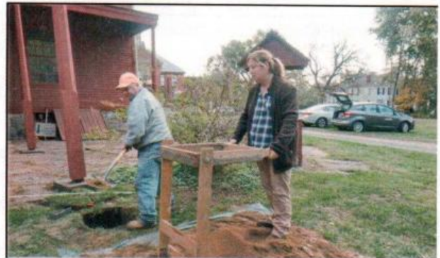
Archaeological test pit behind the Deane House, October 2016.

In the months ahead, we will complete Phase II of the state-mandated archaeological survey on the site of the new building behind the Webb and