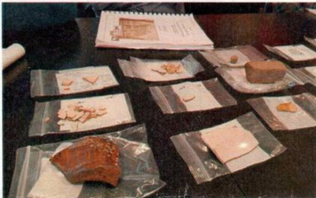
Samples of artifacts found in the fall dig by PAST, Inc. at their headquarters in Storrs, CT

Deane Houses. The first phase was completed this past fall by the Public Archaeology Survey Team, Inc. in Storrs, Connecticut. They excavated nineteen separate 2 x 2 foot test pits on the site and found that the ground was largely intact without prior disturbance and contained a rich concentration of over 7,000 artifacts and information. The artifacts found in the fall dig by PAST, Inc. are currently at their headquarters in Storrs, CT. They will be turned over to the Museum when the excavation is completed.