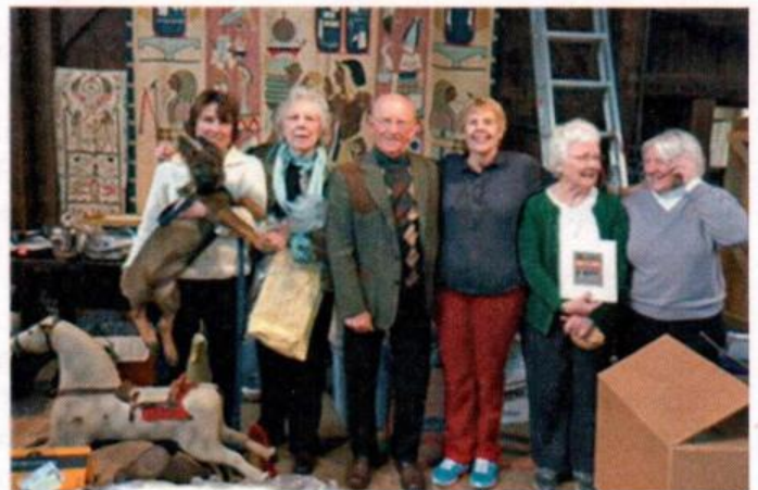
The crew from the last Tags and Treasures in 2016