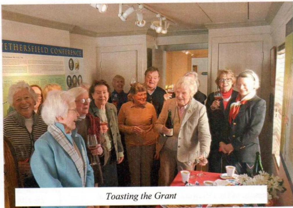
Toasting the Grant