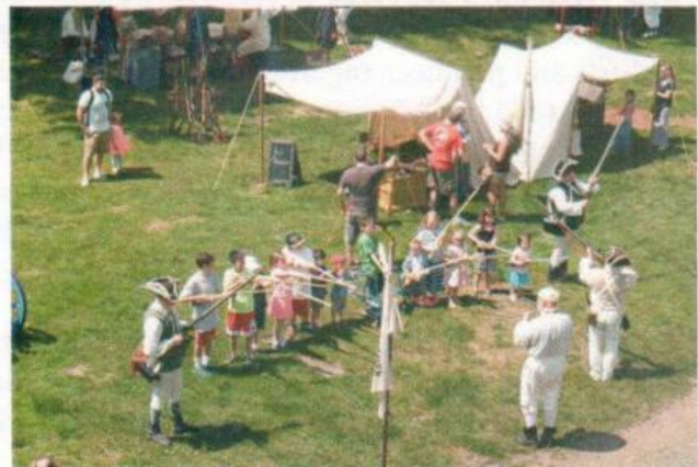
Children doing musket drill with members of the 5 th Connecticut Regiment, May 2016.

Upcoming events include the Revolutionary War Encampment on Memorial Day weekend starting at 10 a.m. on Saturday, May 27, 2017. As in the past, visitors can interact with the members of the 5th Connecticut Regiment and the 54th Regiment of Foot, a British unit, and enjoy educational demonstrations of 18th century medicine, open-fire cookery, camp life, period dress and music, marching and musket firing and more. The Big Bear Trading Company will be present with reproduction 18th and 19 th -century wares for sale. Due to the archaeological dig, we will not be doing the skirmish this year.