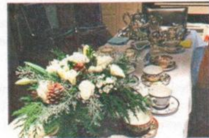
Christmas Tea & Sherry in the Ed. Room